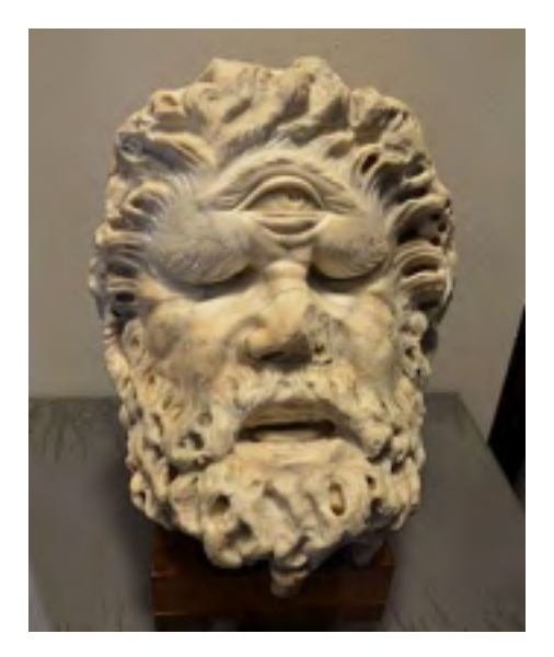
Figure 4. A first century AD head of a Cyclops from the Roman Colosseum

Odysseus calls on Hephaestus (the god of fire) and Hypnos (the god of sleep) to help him, then goes into the cave after Silenus and the Cyclops. The chorus, rather than helping with the blinding directly, offer to cheer him on. They successfully distract the Cyclops by mocking him, which allows Odysseus and his remaining men to escape. The satyrs agree to go with Odysseus and return to their servitude of the god Dionysus.