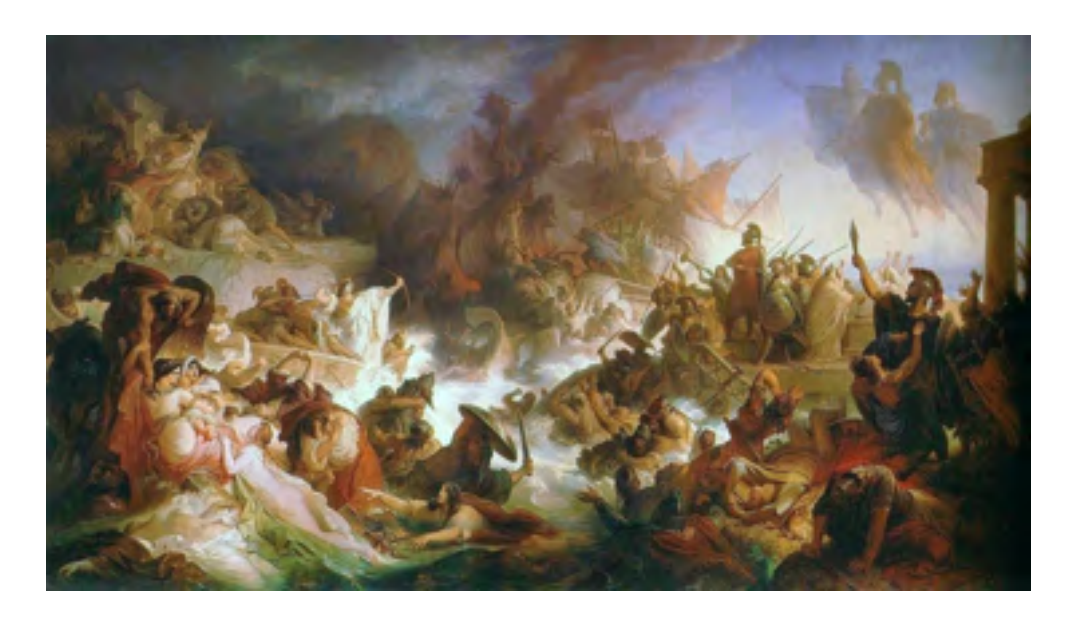
Figure 2. Kaulbach, Wilhelm von - Die Seeschlacht bei Salamis - 1868

Aeschylus, who was the playwright of Persians , actually fought in the battles of Salamis and Plataea on the Greek side.