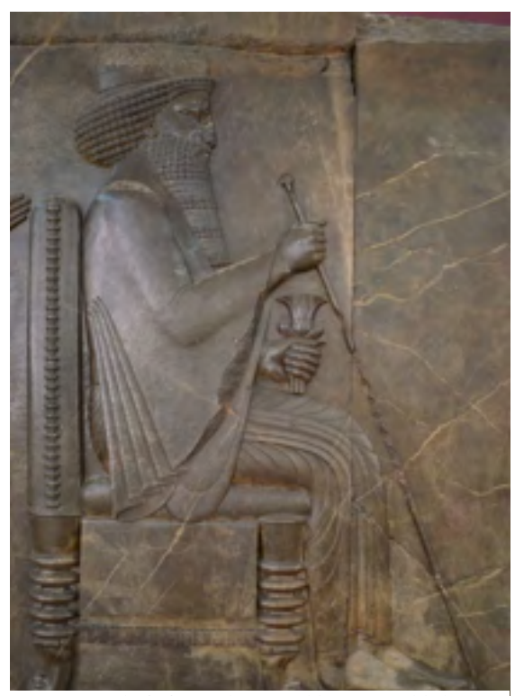
Figure 1. Relief of an Achaemenid king, most likely Xerxes I, the National Museum of Iran

The rest of the play shows King Xerxes alone with the chorus engaged in a kommos (a type of lamenting song) that mourns the enormity of Persia's defeat by the Greeks.