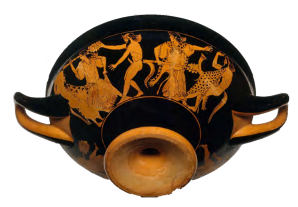
Figure 6. Terracotta kylix (drinking cup), ~490-480 BC Attributed to Makron depicting Satyrs and Maenads

Starting with a popular myth or story, think about how you would insert a chorus of satyrs. What humour would this bring? For example, how could a troupe of satyrs help/hinder Little Red Riding Hood?