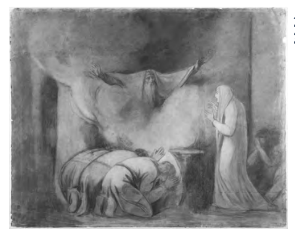
Figure 3. The Ghost of Darius Appearing to Atossa, drawing by George Romney.

Overall, which side of the argument convinces you the most and why?