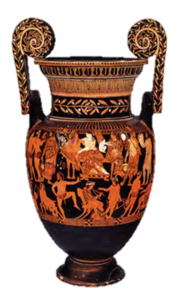
Figure 5 Pronomos Vase, 400 BC, Naples, Museo Nazionale Archeologico. Depicting Satyrs dancing in the worship of Dionysus

The introduction of a chorus of satyrs into a mythological scene is a key element of the satyr play genre. This adds comedic effect as they are driven by their own base instincts causing chaos for the other characters.